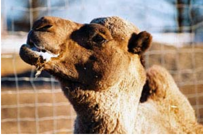
(Frank the Spitting Camel)